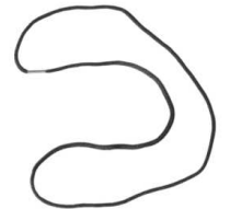
GP 3000-L Lanyard