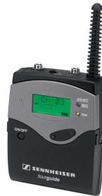
SK 2020-D Bodypack transmitter