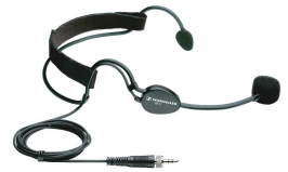
AVL-618 Headband microphone