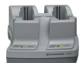
L 2015 2 way transmitter charger