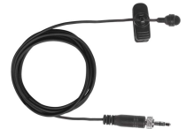
ME 4 Lapel microphone