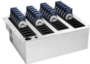
L 2021 40 40 way receiver charger