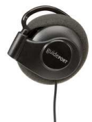
GP 03-M-L Clip-on earphone