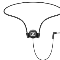
EZT 3012 Neck induction loop