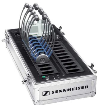
EZL 2020-D Charger/storage case 20 receivers and 2 transmitters