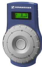
EK 2020-D Bodypack receiver