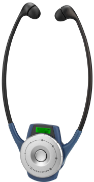
HDE 2020-D Stethoset receiver