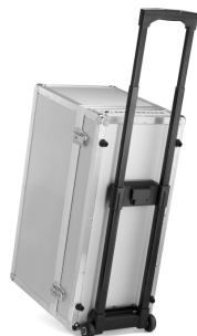
GZR 2020 Trolley frame