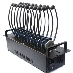
L 2020-10L 10 way receiver charger